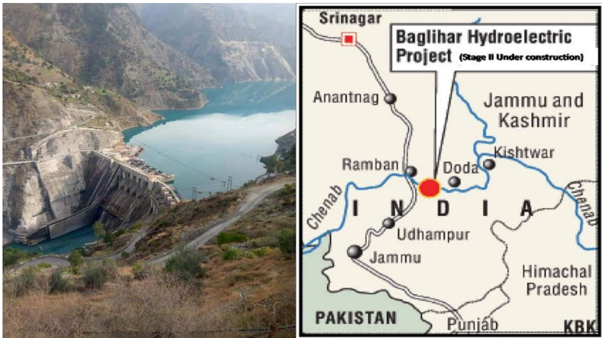
Figure and Map of Baglihar Dam